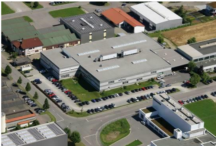
The Axito GmbH company premises in Laupheim.